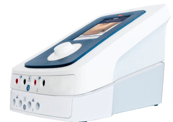
The Vacotron 460 can only be used in combination with the Sonopuls 492 or the Endomed 482.